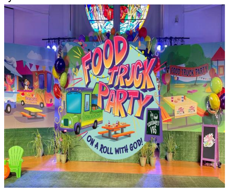
Vacation Bible School is August 1-4th.

There is a sign up sheet, please invite your family and friends. Come enjoy a game and fireworks. Every one is invited