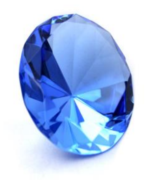
The sapphire is the September birthstone

Special Holidays— 9/4 Labor Day School starts after Labor Day—